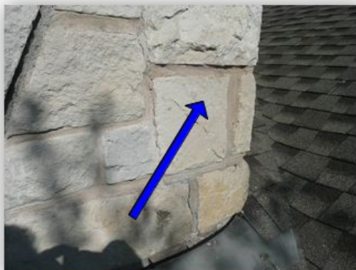
Stones loose on wall