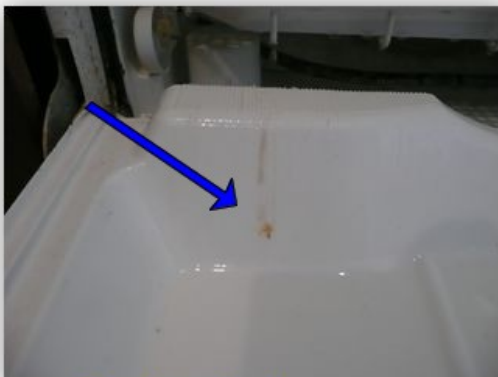
Rust interior door